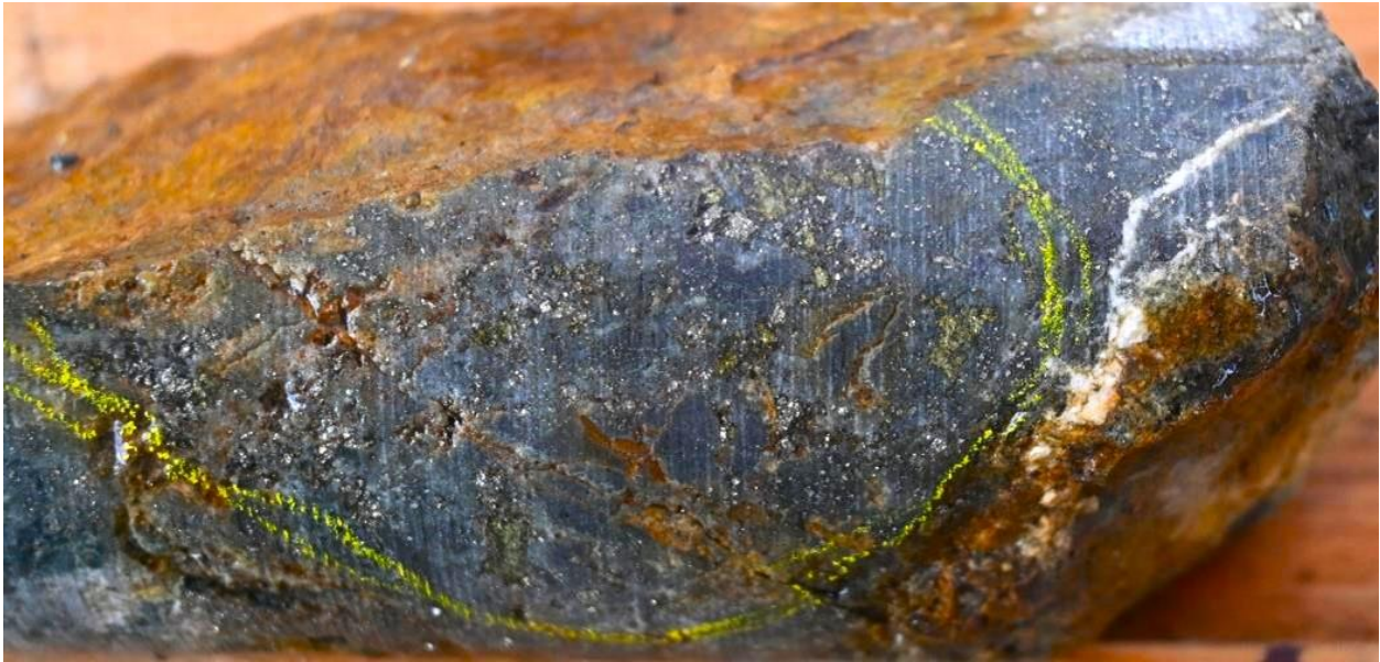
Figure 1 (above) – Sample from DK23-003 showing pyrite and chalcopyrite mineralization.