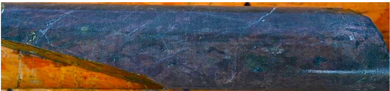
Figure 5 (above) – Sample from DK23-003 showing chalcopyrite mineralization associated with potassic alteration.