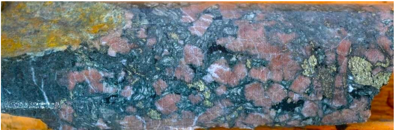
Figure 3 (above) – Sample from DK23-003 showing chalcopyrite mineralization associated with potassic alteration.