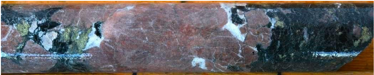
Figure 4 (above) – Sample from DK23-003 showing chalcopyrite mineralization associated with potassic alteration.