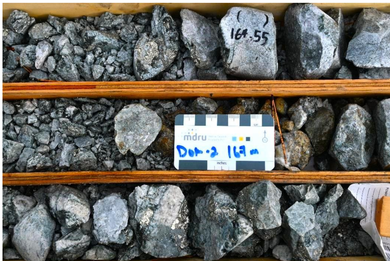
Figure1 (above) Sample from DK2023-002 showing a zone of intense sulphide stockwork. 164.55 is a Terraspec (SWIR) sample location.

British Columbia. Alkalic porphyries frequently occur in clusters, typically several hundred meters across. Alteration halos are less extensive than typical calc-alkalic porphyries. The Galore Creek deposit, 30 km south of the Telegraph property, hosts a cluster of porphyries, collectively containing 1.2 billion tonnes of measured and indicated resource grading 0.46% copper and 0.29 grams per tonne gold, containing 12 billion pounds of copper and 9.4 million ounces of gold. The Galore Creek deposit is currently being advanced in a joint venture between Teck and Newmont.